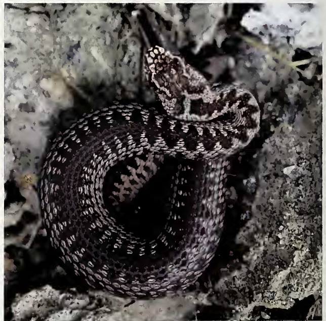
Fig. 2. Juvenile adder Vipera berus , born, 4 August 2013.

The site is an upland moor of predominantly heather Calluna vulgaris , at an altitude of 200 - 250 m, with a shallowly descending northerly aspect, on the south side of Loch Lomond. The moor, of c. 6 km 2 , is surrounded by coniferous forestry plantations on three upper sides and sheep-grazed fields on the lower side, and is crossed by a burn through a gully of some 4 - 8 m in depth and up to 15 m in width, which empties in a northerly direction to Loch Lomond. The slopes of the gully are covered mostly in bracken, with small areas of gorse. The geology is a mixture of peat moorland and exposed granite rock.